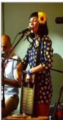
Jane For Tea performing at Ventnor Arts Club.